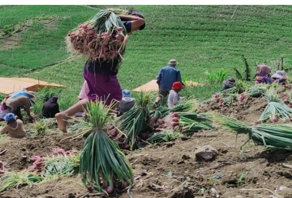
Figure 4 . Community Mutual Cooperation Activities